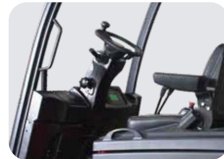
Excellent ergonomic design