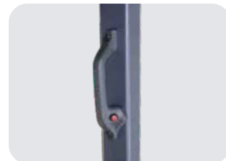
Rear hand holder with horn function (Optional)