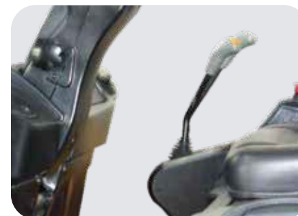
Hydraulic operating handle on the right side