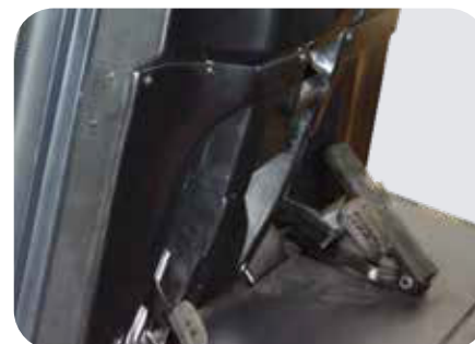
Foot-type parking brake system