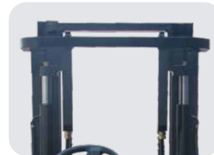
Excellent visibility thanks to optimized