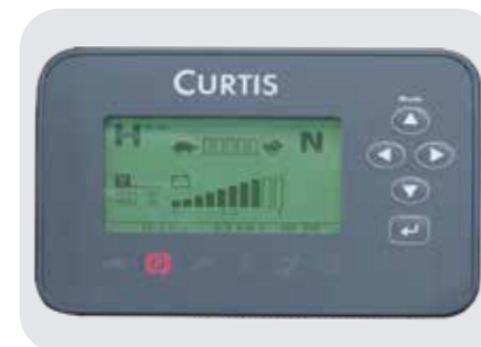
Big LED display